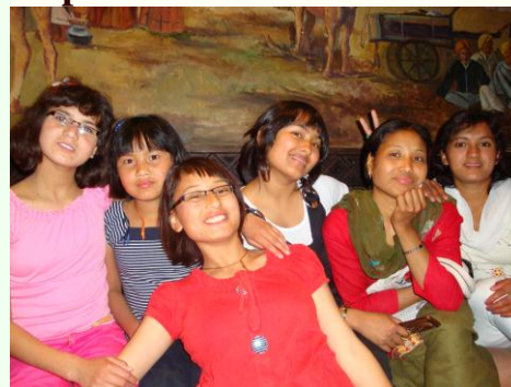
Visiting Gupteswar Caves during our trip to Pokhara

This year for our April vacation, we went back to Pokhara. Our older children from LBU1 have been there many times but this was all new for the children of LBU2. We visited Bahari Temple which is in the middle of Phewa lake and can only be access by barks, the Devil fall, Gupteswar caves, Pokhara museum which shows the lifestyles and history of Nepal ethnic groups as well as details of the different ascents of some of the highest mountains in the world which are situated in Nepal. We also celebrated the Nepalese New Year with a nice meal and some dancing.